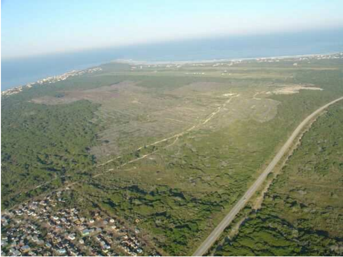
Photo2- An aerial photo of the Thatch Farm with the local Community of Sea Vista on the foreground.