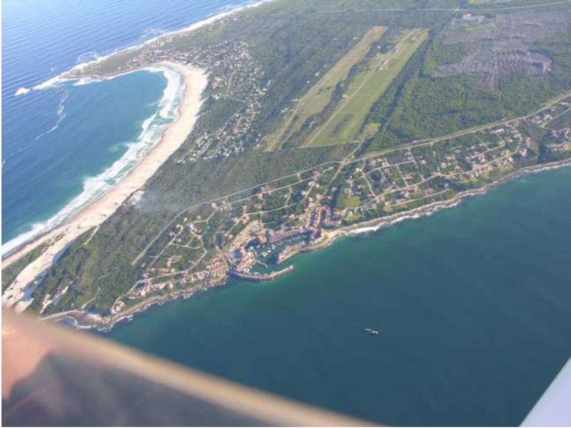
Photo 1- An aerial view of Port St Francis on the fore with the Santareme Village adjacent to it and Cape St Francis to the left upper part of the photo. The airfield is situated visible in the centre of this photo with the St Francis Bay Thatch Farm Project to the upper right hand side. The grey areas are the rows of slash that remains after a clearing operation.