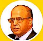
Padma Vibhushan Dr. K. Kasturirangan Chairman, National Education Policy -2020

National Education Policy (2020) - The Broad Contours