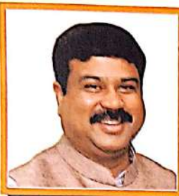
Shri Dharmendra Pradhan

Hon'ble Minister of Education & Minister of Skill Development and Entrepreneurship, Government of India.